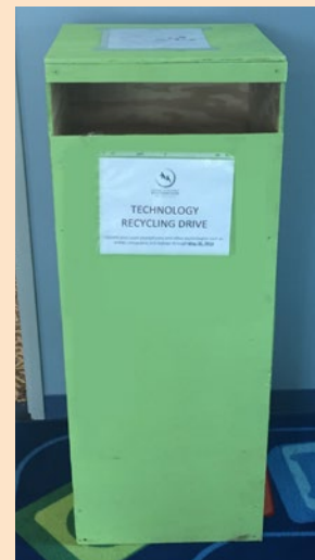
Recycling bins are located throughout both CAA and Ted Berry.

In August, the CAA Foundation partnered with third party vendor ELI Smart Solution to launch its first technology drive fundraiser. The community is encouraged to donate old, used smartphones and other technologies such as tablets, computers and laptops for recycling. All proceeds will benefit the Foundation and support CAA programs. This fundraiser runs through May 31, 2016, so please continue to clean out your clutter and donate to support the Foundation!