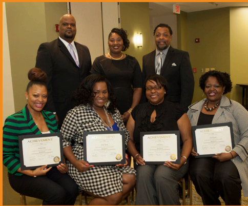
GCM staff with graduates of Business Class II.